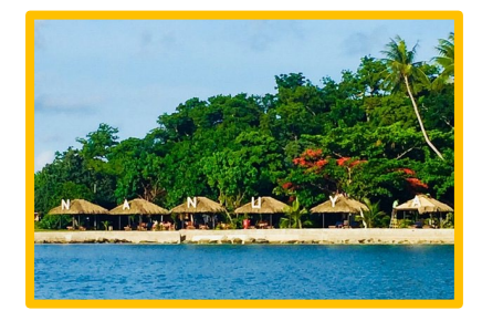
YASAWA GROUP OF ISLANDS